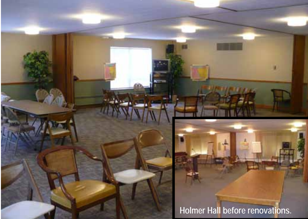
Holmer Hall before renovations.